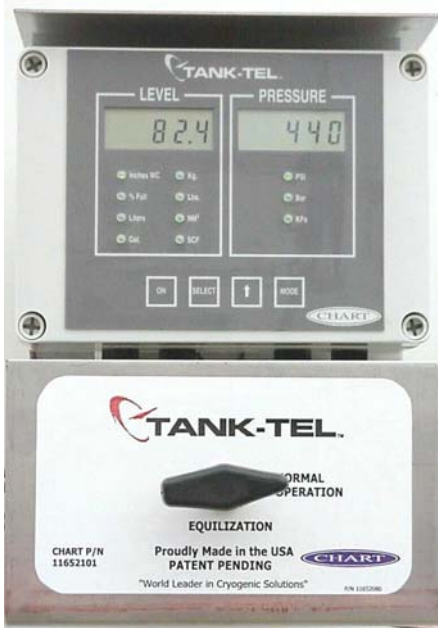
Tank-Tel Gauge Assembly Complete with Isolation Valve