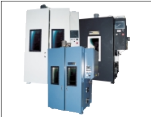
Chart Industries is the leading supplier of cryogenic equipment and services in the world. Headquartered in Cleveland, Ohio, the organization serves the global industrial gas and hydrocarbon processing markets and numerous end user applications. Chart Applied Technologies (formerly MVE Applied Technologies) is now one of eight operating divisions that Chart has created to form the only one-stop-shop for state-of-the-art Environmental and HALT/HASS Test Chambers.

Don't see the model you need in our standard products? Feel free to ask about Chart's ability to rapidly customize a chamber to best suite your application. Chart has the capability of customizing chamber size, air flow plenums, control system options, port sizes and locations, etc. In fact, we'll even paint the chamber any color you want it match your company logo's or other equipment! We encourage you to bring your ideas to our engineering group to help design a chamber perfect for your needs.